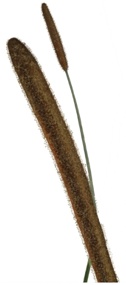
G AUSTRALIA Xanthorrhoea Resinosa