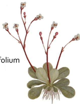
K AUSTRALIA Stylidium Rotundifolium