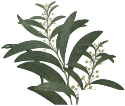
F AUSTRALIA Acacia Legnota