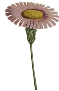
I AUSTRALIA Olearia Arguta